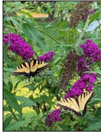
Butterflies!