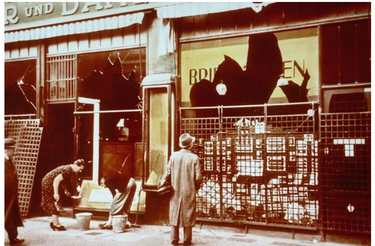
The morning after Kristallnacht or Night of Broken Glass in Berlin, 1938.

On Thursday, Nov. 9 at 5 p.m., we are planning a special service of remembrance, healing, and prayer on the anniversary of the Kristallnacht . Readers will be sharing stories of children who lived through the wave of antisemitic violence of 1938 Berlin. Thousands of Jewish homes and businesses were destroyed. Fourteen hundred synagogues were burned; cemeteries were ravaged. In the days that followed, 30,000 Jewish men would be sent to concentration camps.